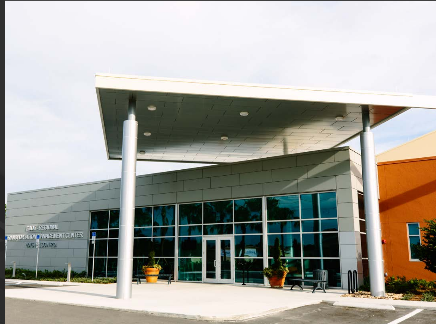
FDOT- Regional Transportation Management Center

Collage understands and supports government procurement requirements and has strong alliances with 8a, HUBZone and Service-Disabled Veteran Firms. Collage has established continuing Mentor/Protege relationships and partnership to provide services for specific federal and federally funded projects. Our goal is to be a professional construction services company that through teaming and joint ventures infuses focus, service and integrity into the smallest details of a project and defines success through building solid relationships as well as projects. Collage has built our reputation on an uncompromising commitment to meeting our clients' requirements and program needs as well as competitive, value-driven pricing and clear, concise communication. Our commitment and attention to detail is evident in every project and government contract we perform. Our commitment to our nation is clear, and our pride in what we do is seen in the quality and the results. We bring success to building our country along with the honor to serve it.