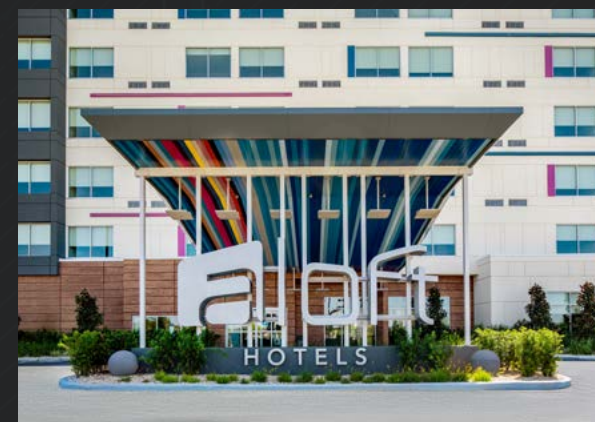
Aloft Lake Buena Vista