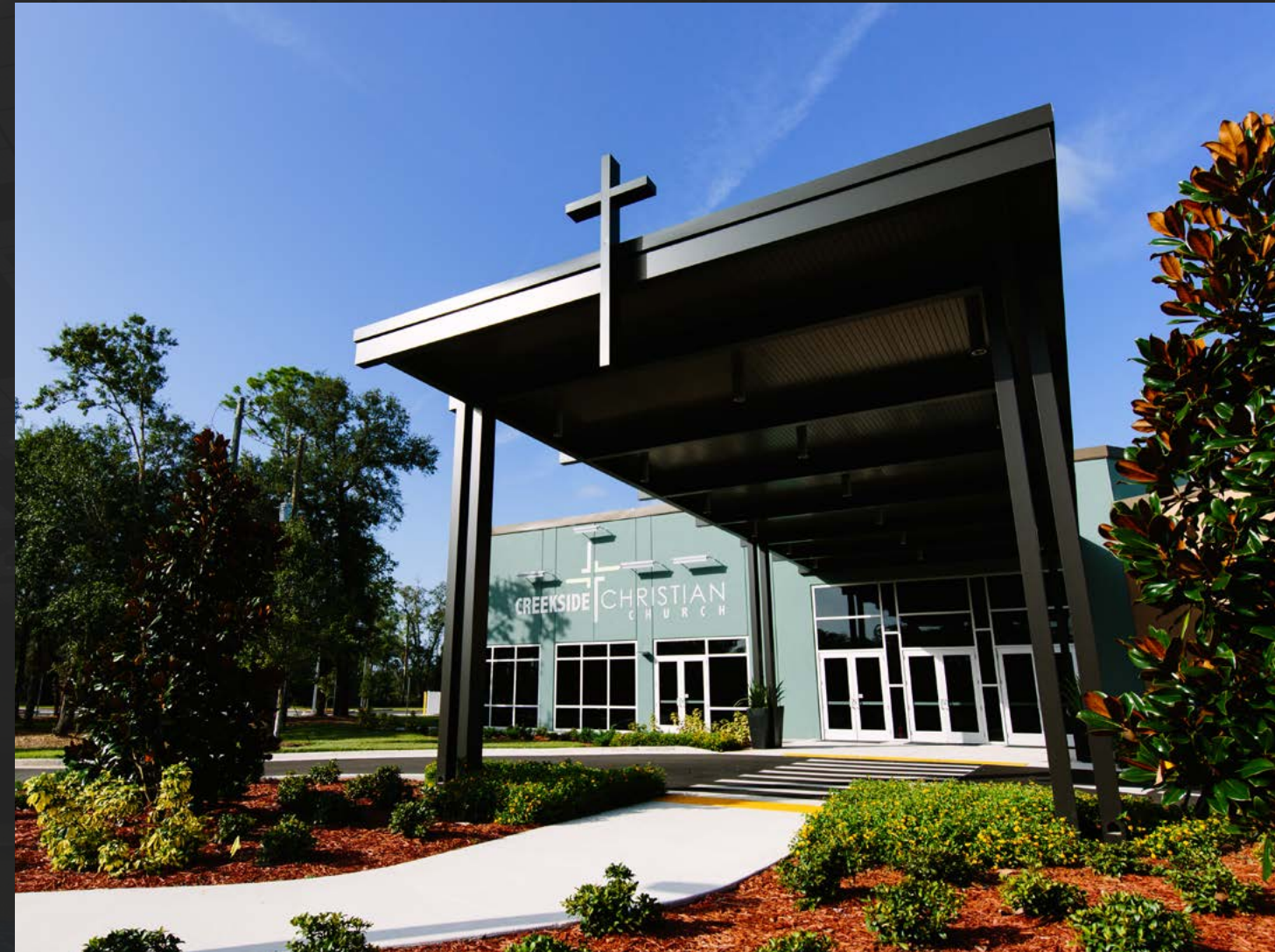
Creekside Christian Church

In no other area of construction does Collage better exhibit our commitment to excellence, to quality, to stewardship and to the community, than in church construction. God has a vision for your church or community organization. Our vision is to help you build it.