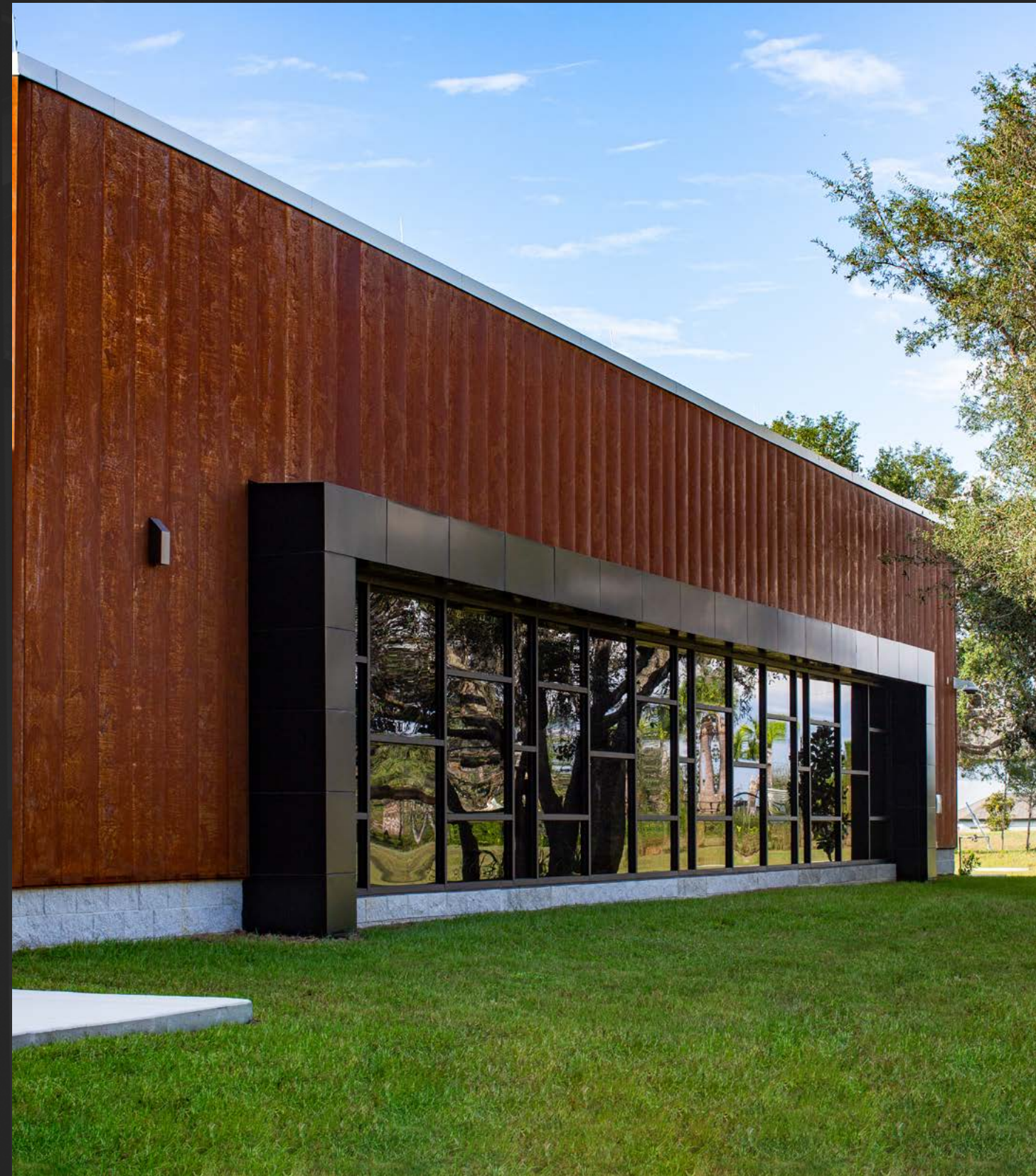
St.John's River Water Mgmt District- Apopka Service Center

Each delivery method has its own advantages for your particular project and our team will listen first and then integrate into the team to bring leadership, proven accountability and success. We know the needs of your industry are unique and we know your project has specific requirements. We intend to meet them both. At Collage we desire to become a valued member of your team and an integral part of your projects' success, we will do whatever it takes to make that happen.