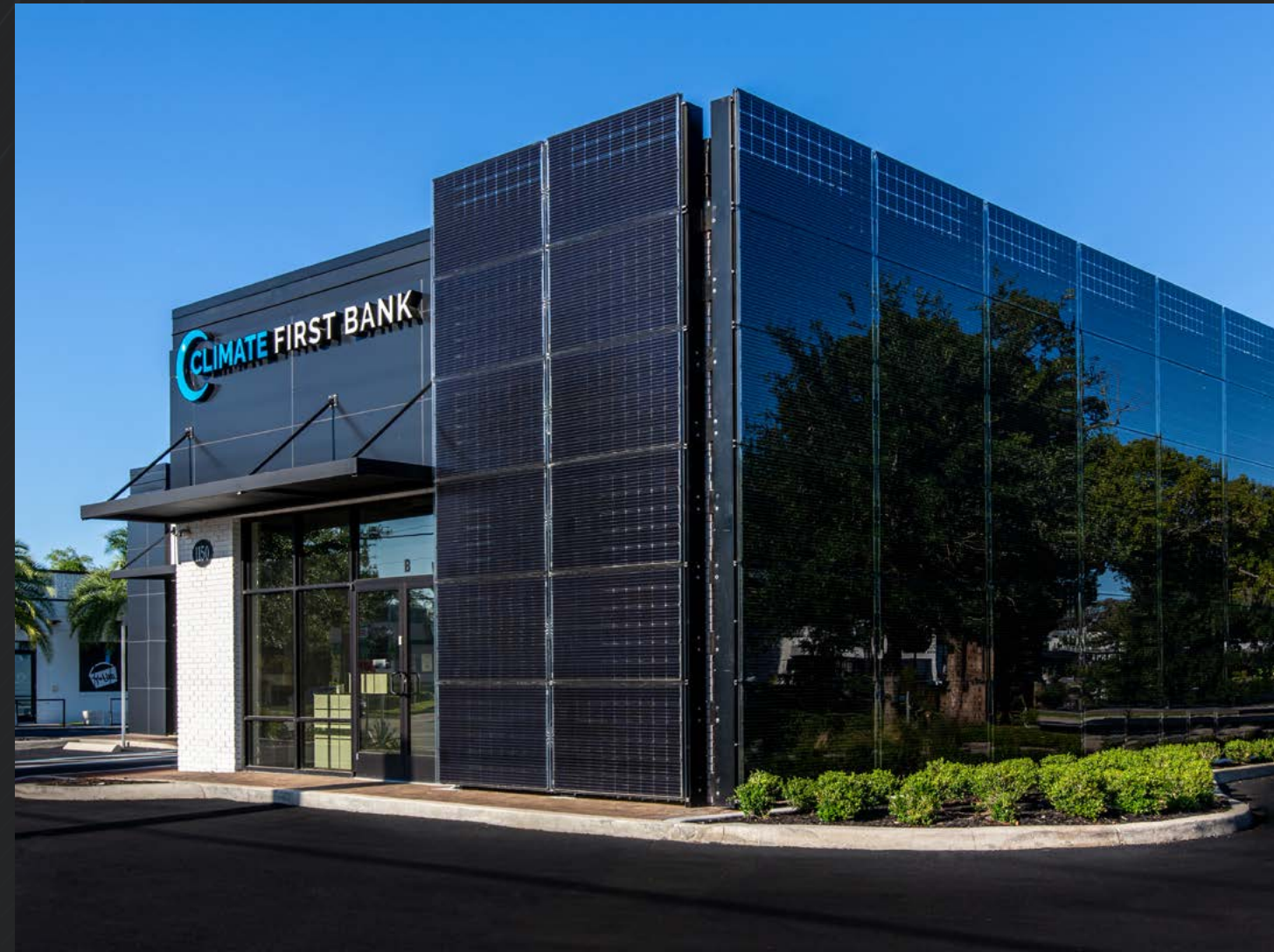
Climate First Bank Winter Park

You need assurance and Collage provides it...Guaranteed!