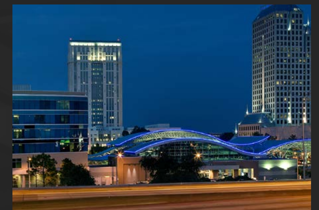
Lynx Central Station