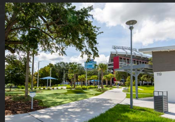
Lake Lorna Doone Park