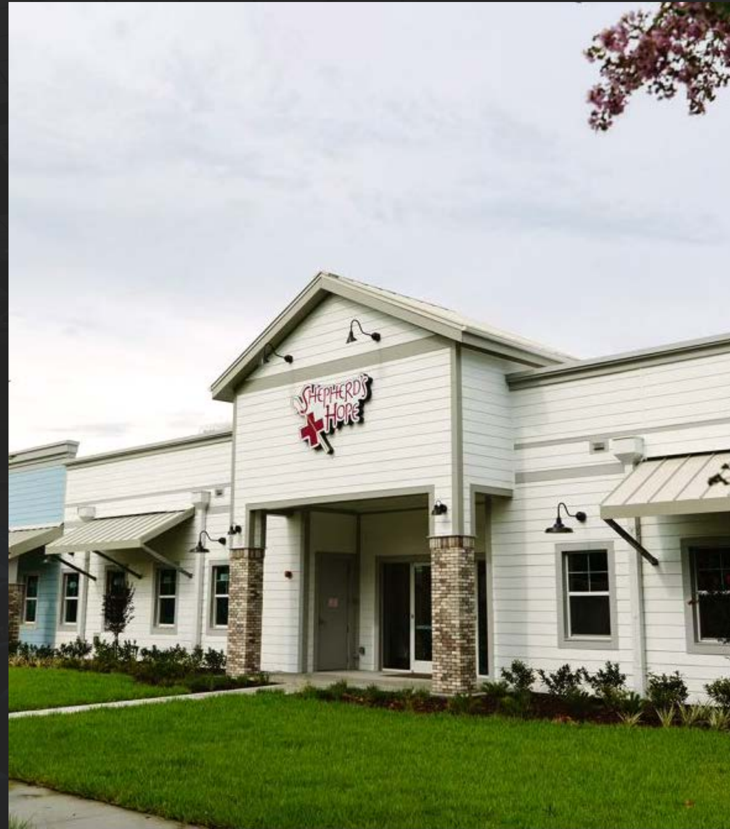
Shepherd's Hope West Orange Medical Center

Collage has taken on the challenge to bring the multitude of resources and years of experience that we have to meet the needs of our clients, not only today, but in the future for the complex and ever changing world of medicine, clean rooms, operating rooms, etc. that require unequalled quality and unwavering standards. Years of experience have proven that not only do we care how we build; we care.