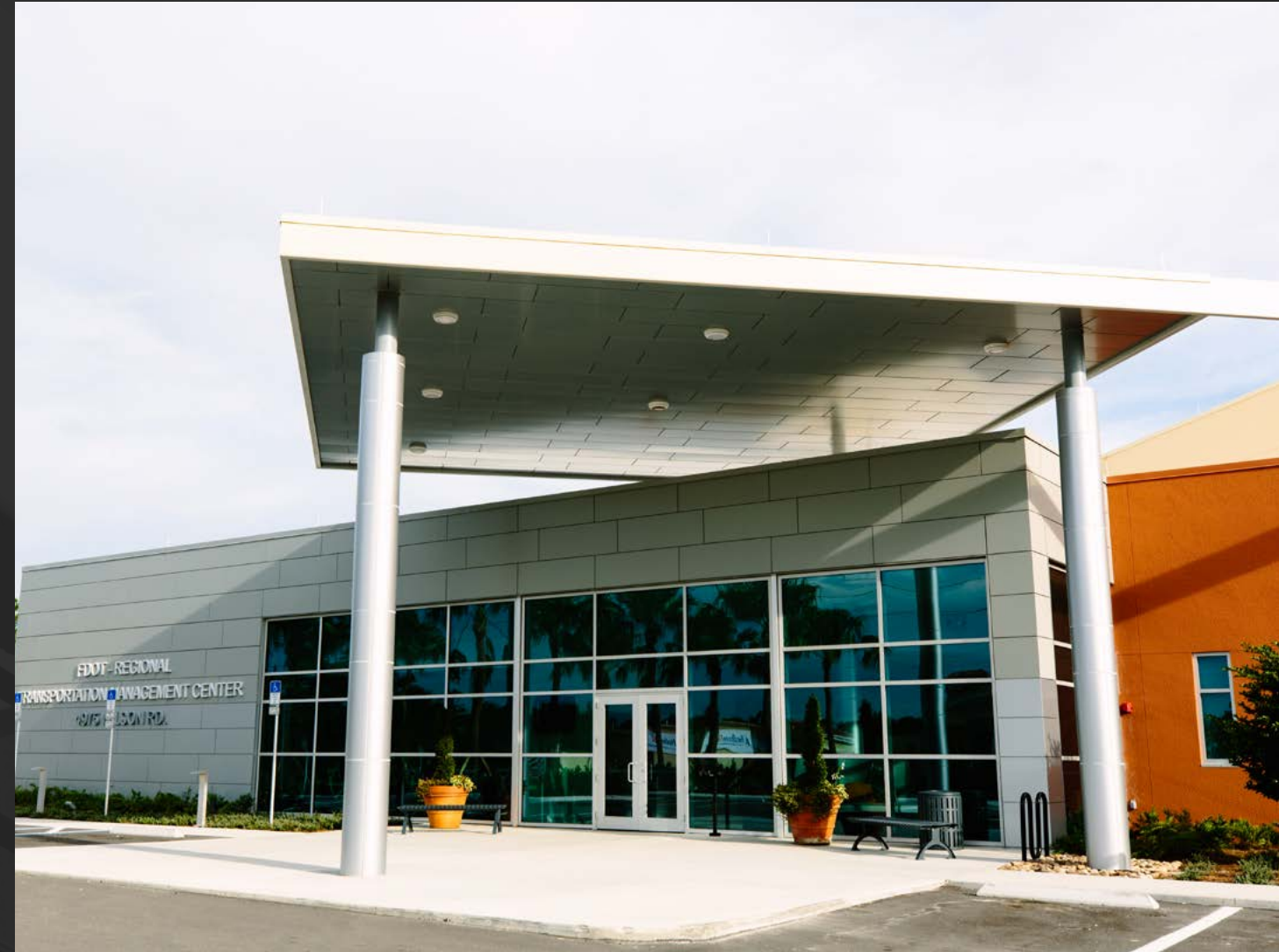
FDOT- Regional Transportation Management Center

Collage understands and supports government procurement requirements and has strong alliances with 8a, HUBZone and Service-Disabled Veteran Firms. Collage has established continuing Mentor/Protege relationships and partnership to provide services for specific federal and federally funded projects. Our goal is to be a professional construction services company that through teaming and joint ventures infuses focus, service and integrity into the smallest details of a project and defines success through building solid relationships as well as projects. Collage has built our reputation on an uncompromising commitment to meeting our clients' requirements and program needs as well as competitive, value-driven pricing and clear, concise communication. Our commitment and attention to detail is evident in every project and government contract we perform. Our commitment to our nation is clear, and our pride in what we do is seen in the quality and the results. We bring success to building our country along with the honor to serve it.