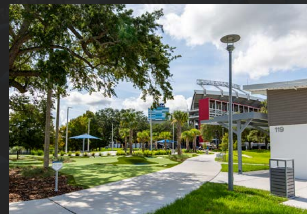
Lake Lorna Doone Park