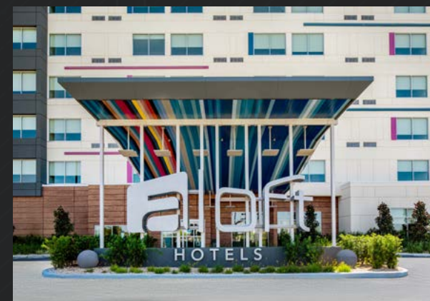
Aloft Lake Buena Vista