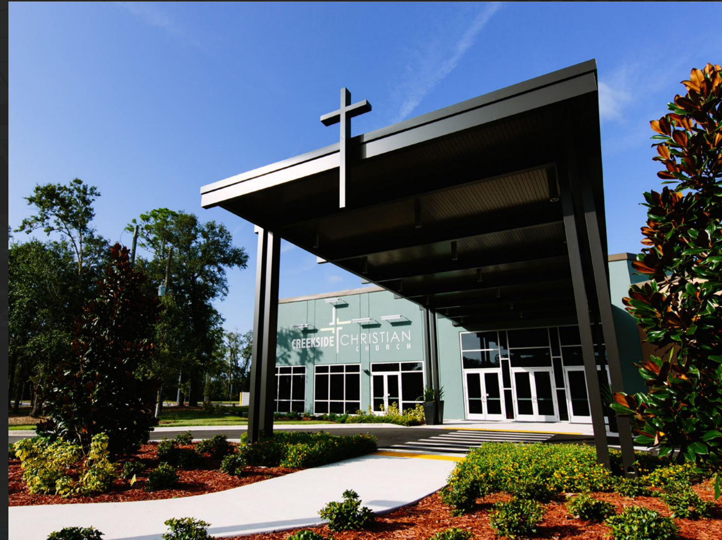
Creekside Christian Church

In no other area of construction does Collage better exhibit our commitment to excellence, to quality, to stewardship and to the community, than in church construction. God has a vision for your church or community organization. Our vision is to help you build it.