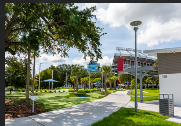
Lake Lorna Doone Park