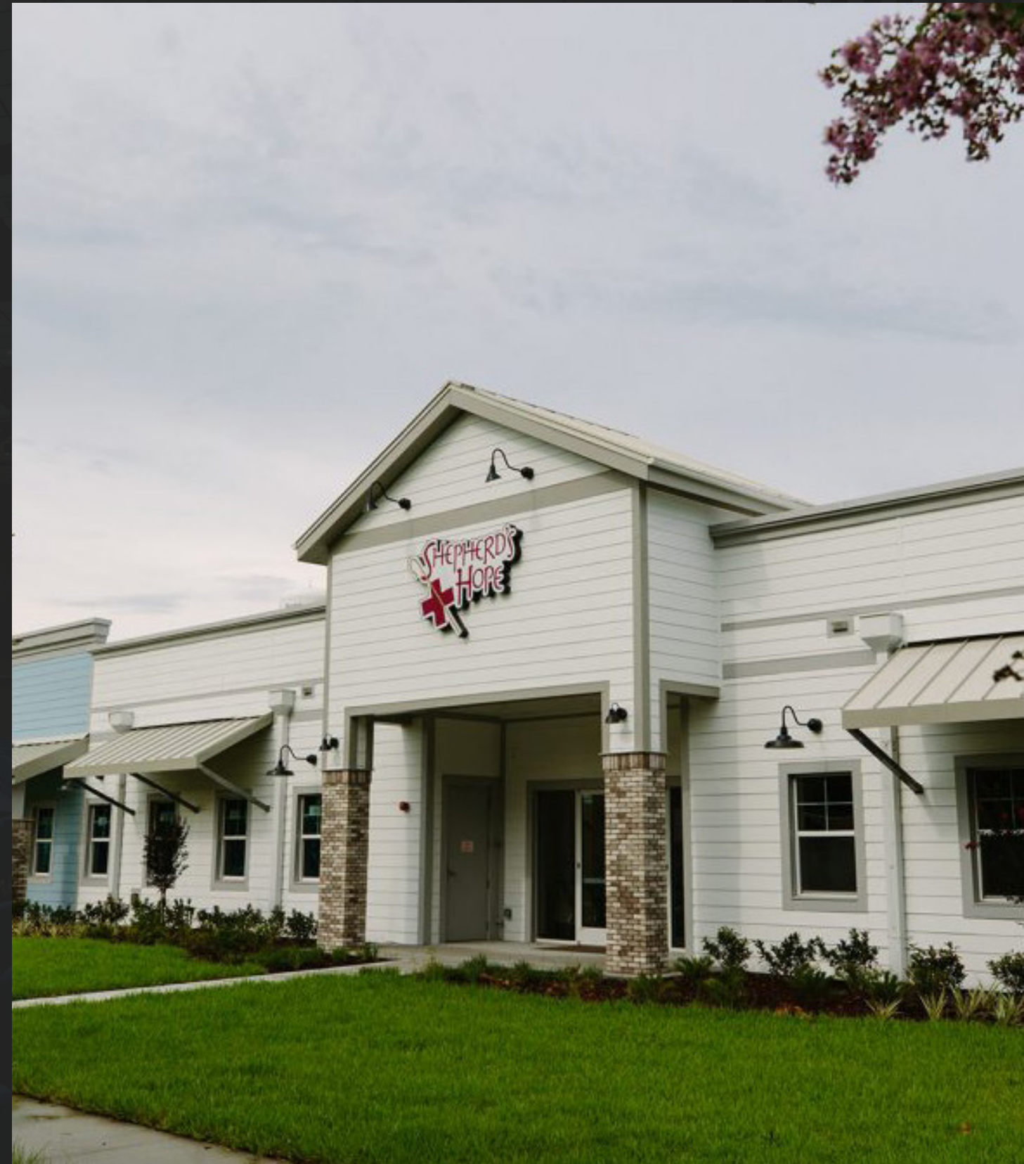
Shepherd's Hope West Orange Medical Center

Collage has taken on the challenge to bring the multitude of resources and years of experience that we have to meet the needs of our clients, not only today, but in the future for the complex and ever changing world of medicine, clean rooms, operating rooms, etc. that require unequalled quality and unwavering standards. Years of experience have proven that not only do we care how we build; we care.