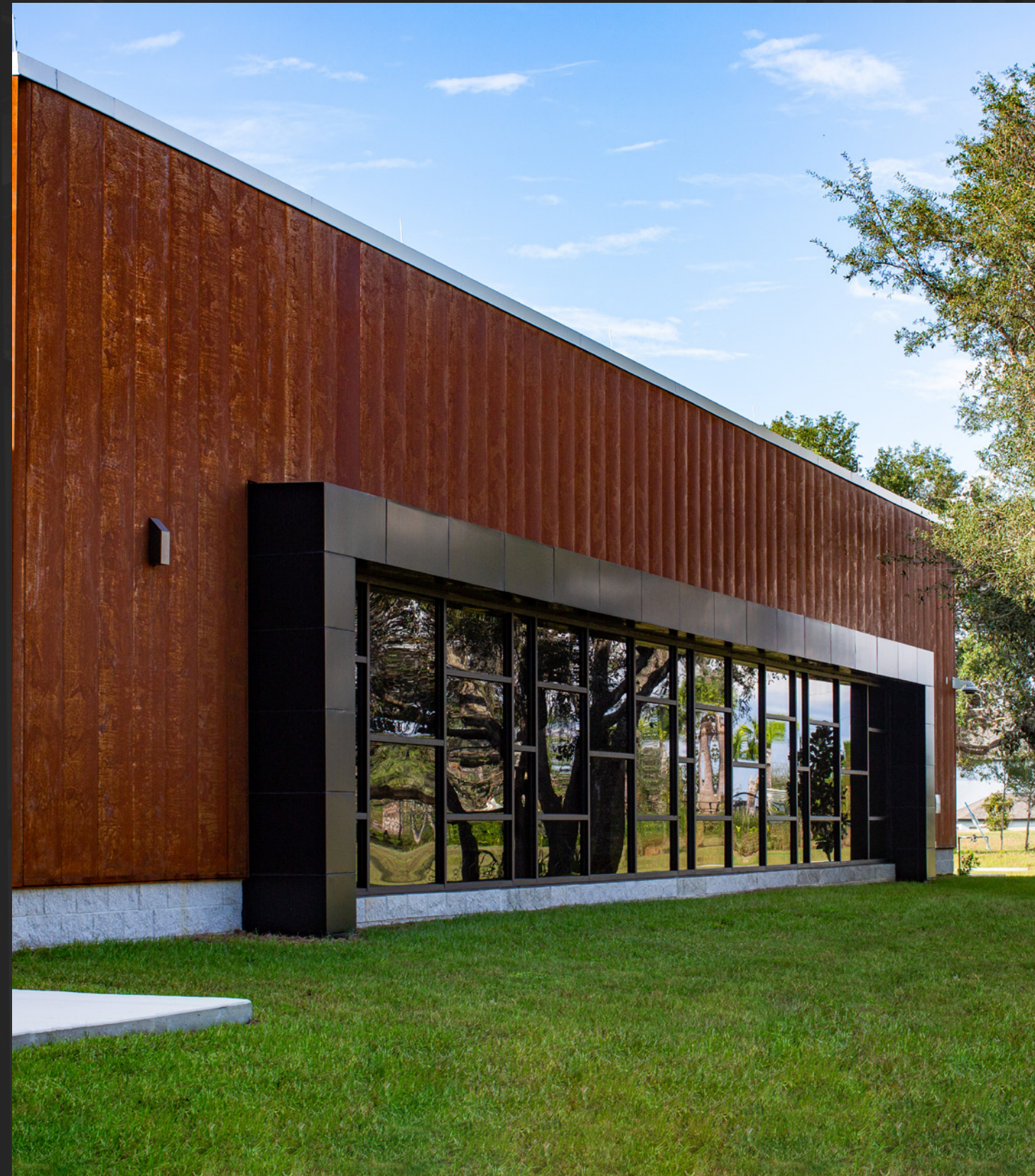
St.John's River Water Mgmt District- Apopka Service Center

Each delivery method has its own advantages for your particular project and our team will listen first and then integrate into the team to bring leadership, proven accountability and success. We know the needs of your industry are unique and we know your project has specific requirements. We intend to meet them both. At Collage we desire to become a valued member of your team and an integral part of your projects' success, we will do whatever it takes to make that happen.