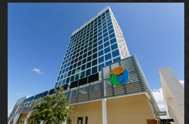
First Green Bank Downtown Orlando