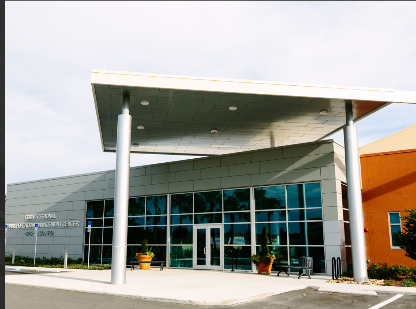
FDOT- Regional Transportation Management Center

Collage understands and supports government procurement requirements and has strong alliances with 8a, HUBZone and Service-Disabled Veteran Firms. Collage has established continuing Mentor/Protege relationships and partnership to provide services for specific federal and federally funded projects. Our goal is to be a professional construction services company that through teaming and joint ventures infuses focus, service and integrity into the smallest details of a project and defines success through building solid relationships as well as projects. Collage has built our reputation on an uncompromising commitment to meeting our clients' requirements and program needs as well as competitive, value-driven pricing and clear, concise communication. Our commitment and attention to detail is evident in every project and government contract we perform. Our commitment to our nation is clear, and our pride in what we do is seen in the quality and the results. We bring success to building our country along with the honor to serve it.