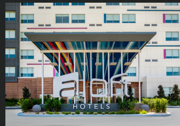
Aloft Lake Buena Vista