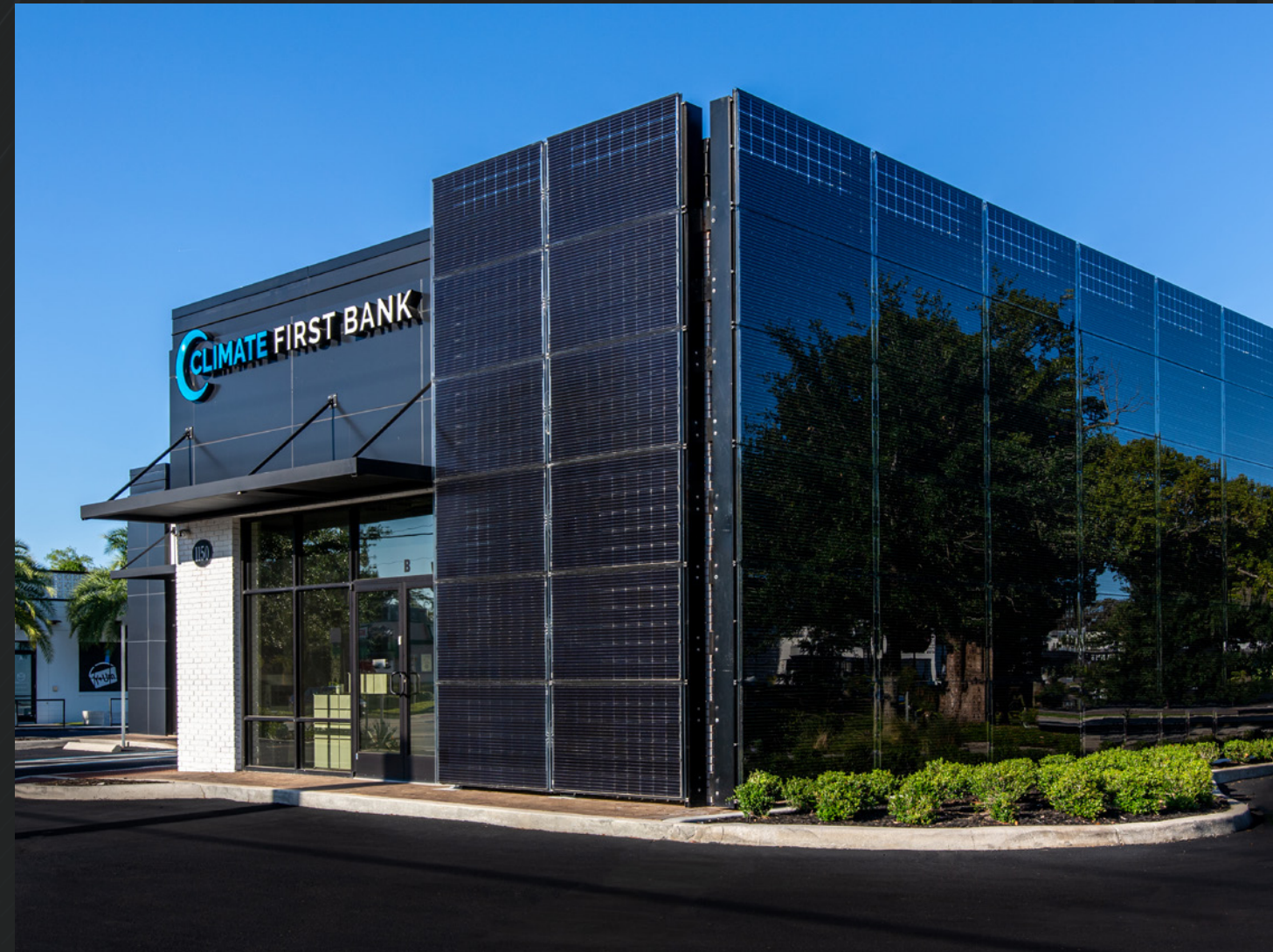
Climate First Bank Winter Park

You need assurance and Collage provides it...Guaranteed!